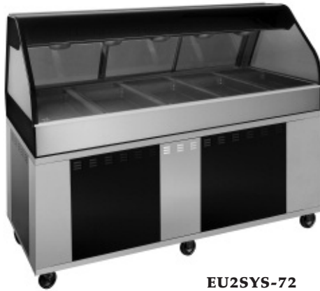
EU2SYS-72 FRONT VIEW SHOWN WITH OPTIONAL CASTERS